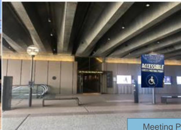
Meeting Point from 5:30pm